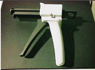
50 ml Dual Cartridge