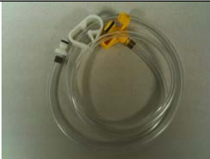
5cc Syringe ADAPTER 0008