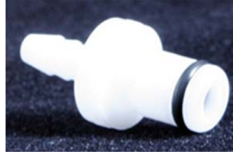
Male connector with barb and quick disconnect CONNECT0027-SS