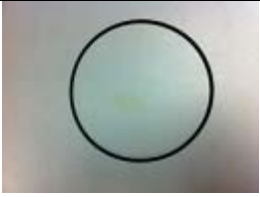
Reservoir gasket 009