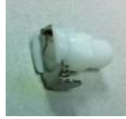
Male quick disconnect X 1/8" NPT