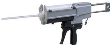
400 ml dual cartridge