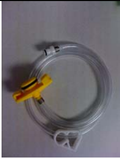
30cc Syringe ADAPTER 0010