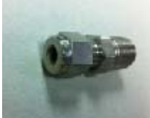
1/4" stainless steel female compression connector