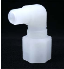
1/4" NPT X 1/4" Tube X 90° Kynar Fitting