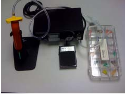
Autobonder 2101-H Hernon part number: AUTO2101-H