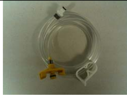
3cc Syringe ADAPTER 0007