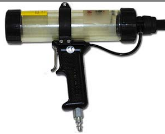
300 ml cartridge