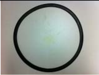
Reservoir gasket 20