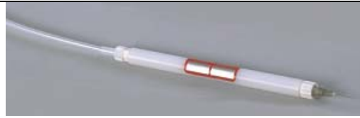
Dispensing Pen without switch