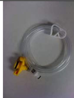
10cc Syringe ADAPTER 0009