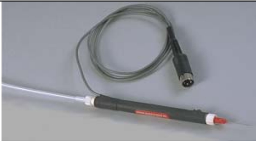
Dispensing pen without control switch