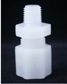
Adapter -1/8" NPT x 1/4" tube Kynar Fittings